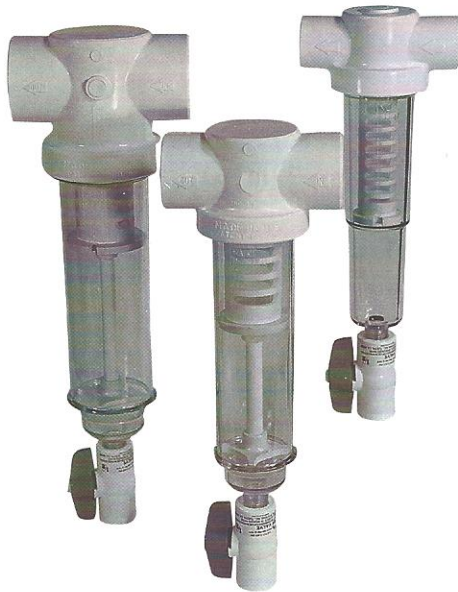
T Style (NT)