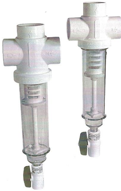
Combo Style (CF)