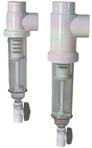
L Style (L)